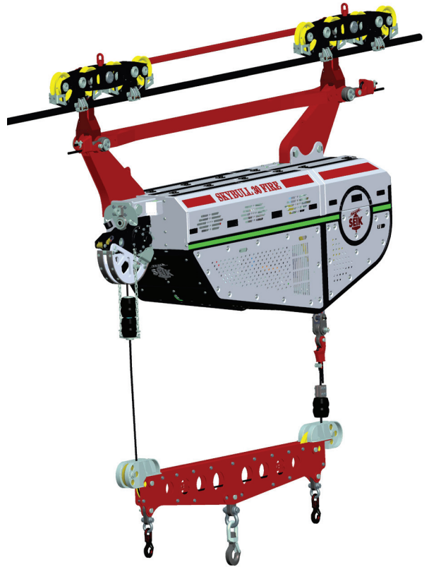
Skybull 30 adapted for use on construction sites